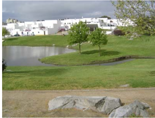
Malagueira | Evora