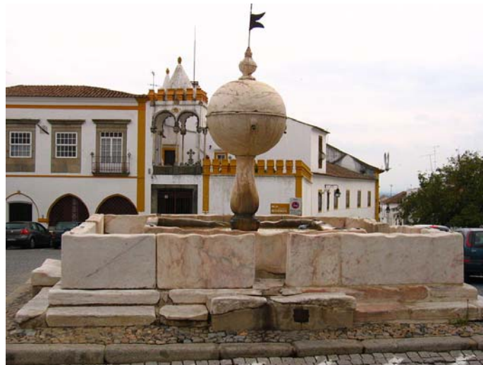
Largo das Portas de Moura | Évora